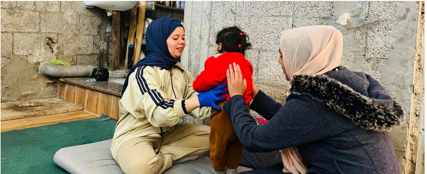
The Princess Basma Centre helping children in Jerusalem.

The Princess Basma Centre has been supporting children since 1964. It opened primarily to care for children who needed physiotherapy, due to widespread polio in the Palestinian community. When the Centre opened many of the children had to travel long distances to get there, and so they lived at the Centre during school term time and at times during the holidays if their families could not look after them. The Centre also provides schooling for children to support their educational needs.