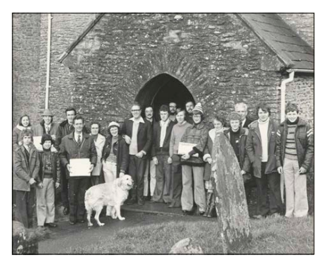
The band with supporters at Exton the day after